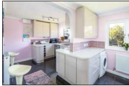
Kitchen Breakfast Room