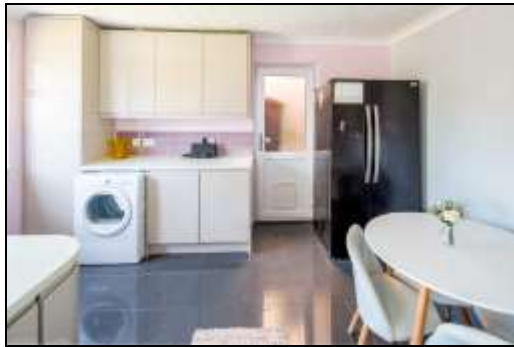
Kitchen Breakfast Room