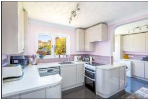
Kitchen Breakfast Room