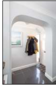
Entrance Hall and Cloakroom