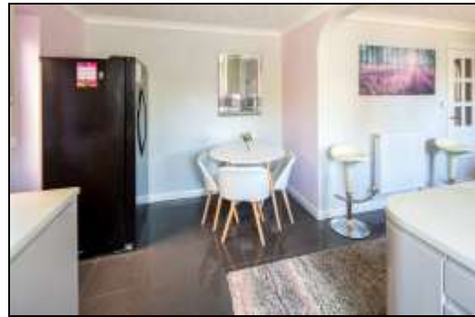
Kitchen Breakfast Room