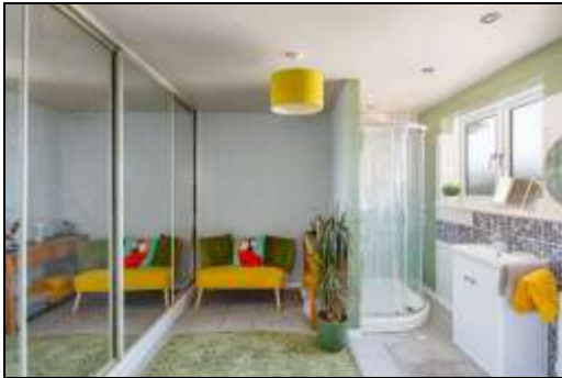
Dressing Area/En-Suite to Bedroom One