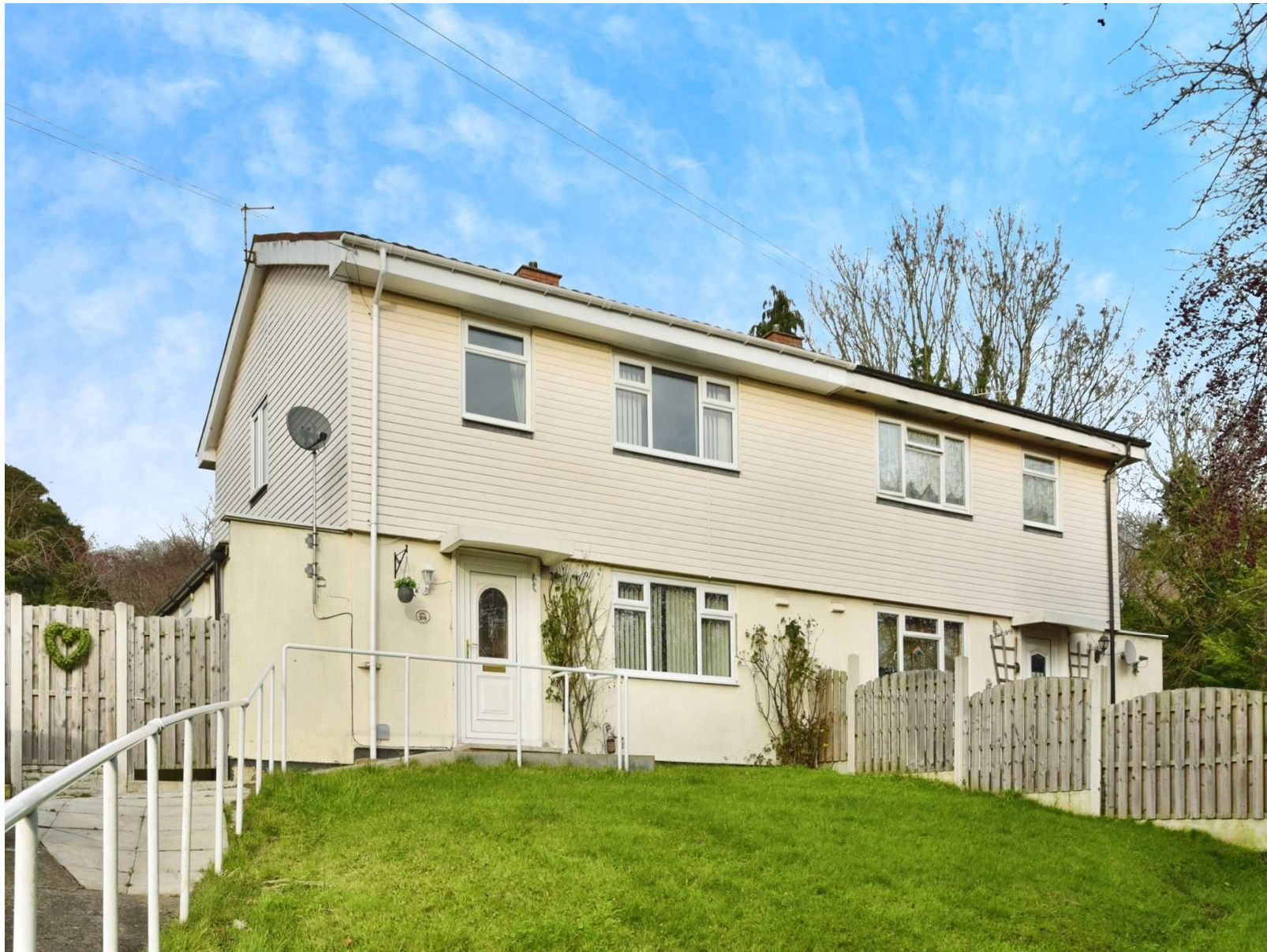
Brierley Road, Unstone Dronfield S18 4DF