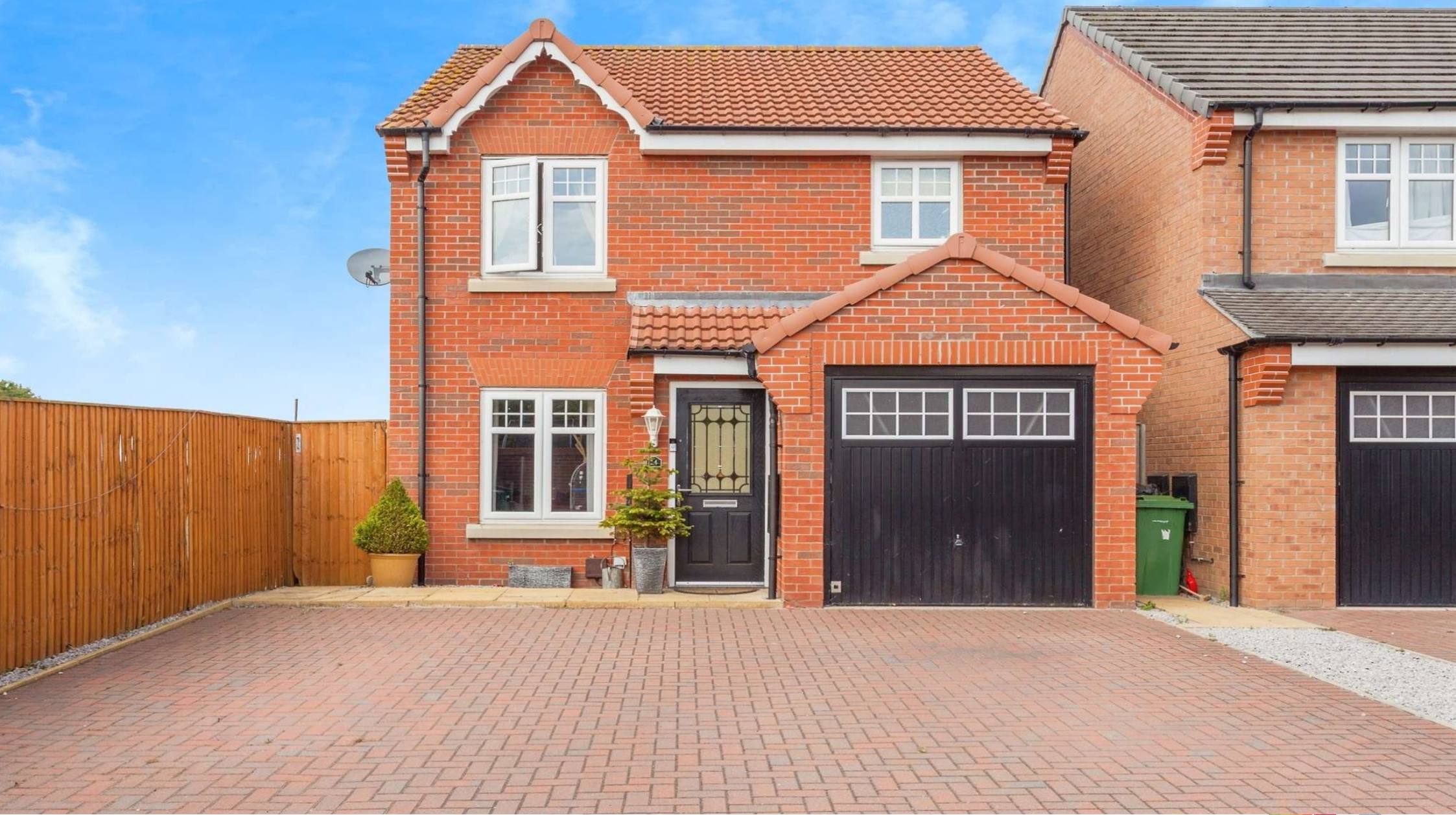
Herbage View, Crofton Wakefield WF4 1FD