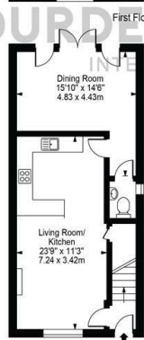
Ground Floor For Illustration Purposes Only - Not To Scale

This floor plan should be used as a general outline for guidance only and does not constitute in whole or in part an offer or contract. Any intending purchaser or lessee should satisfy themselves by inspection, searches, enquiries and full survey as to the correctness of each statement. Any areas, measurements or distances quoted are approximate and should not be used to value a property or be the basis of any sale or let.