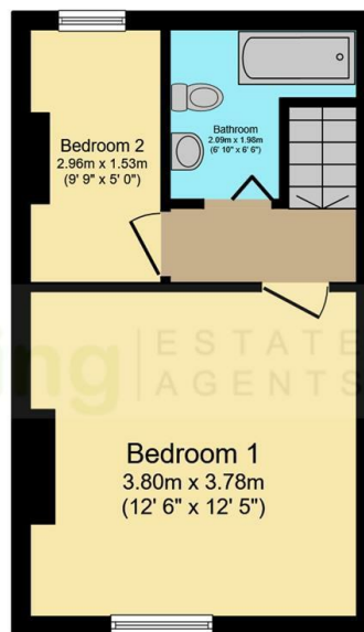
First Floor Floor area 26.1 sq.m. (280 sq.ft.)

Total floor area: 52.1 sq.m. (561 sq.ft.)