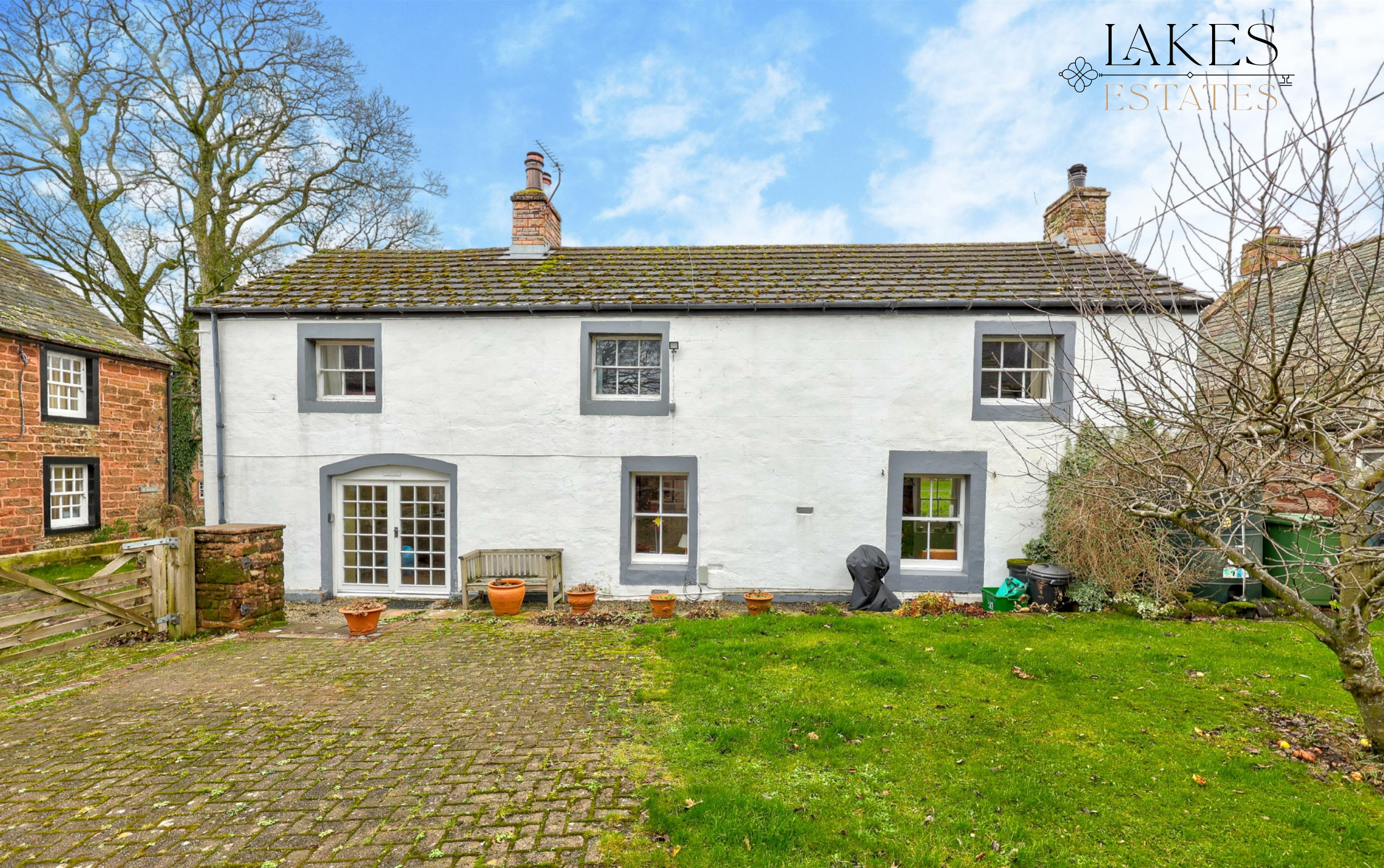
The Old Cloggers , Gamblesby, CA10 1HR