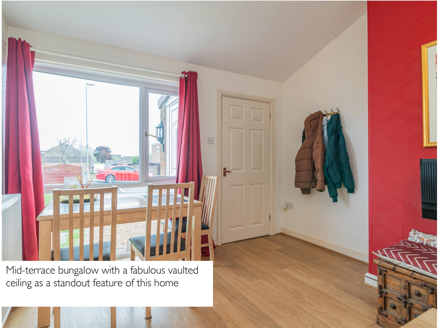
Mid-terrace bungalow with a fabulous vaulted ceiling as a standout feature of this home

Excellent mid-terrace home featuring level living and comprising two bedrooms, a modern kitchen and a family bathroom. It benefits from parking to the front and a single garage, offering convenient off-street parking and storage solutions and having a secure garden to the rear.