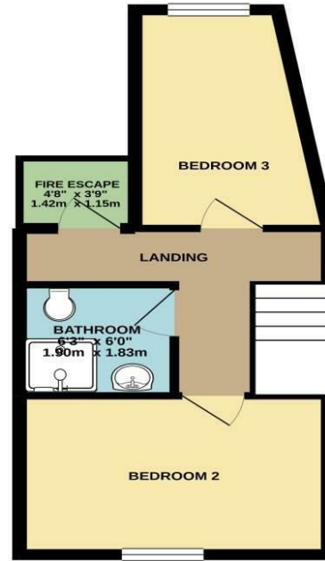
1ST FLOOR 299 sq. ft. (27.8 sq. m.) approx.