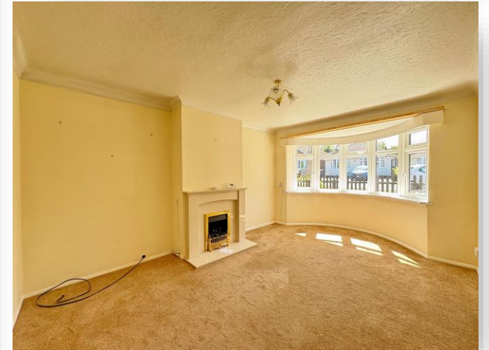
Woodland Avenue, Overstone Northampton NN6 0AJ