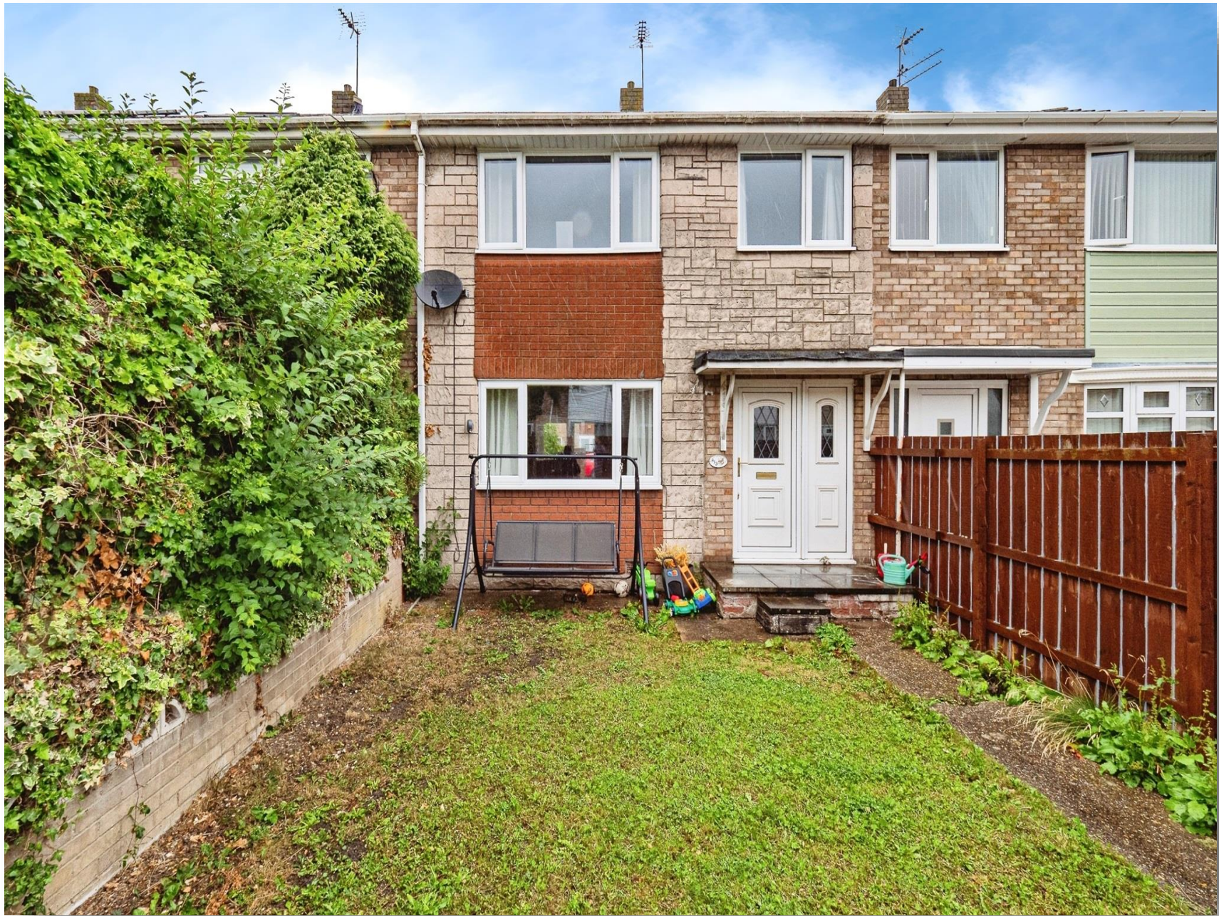
Newtondale, Hull, HU7 4BW