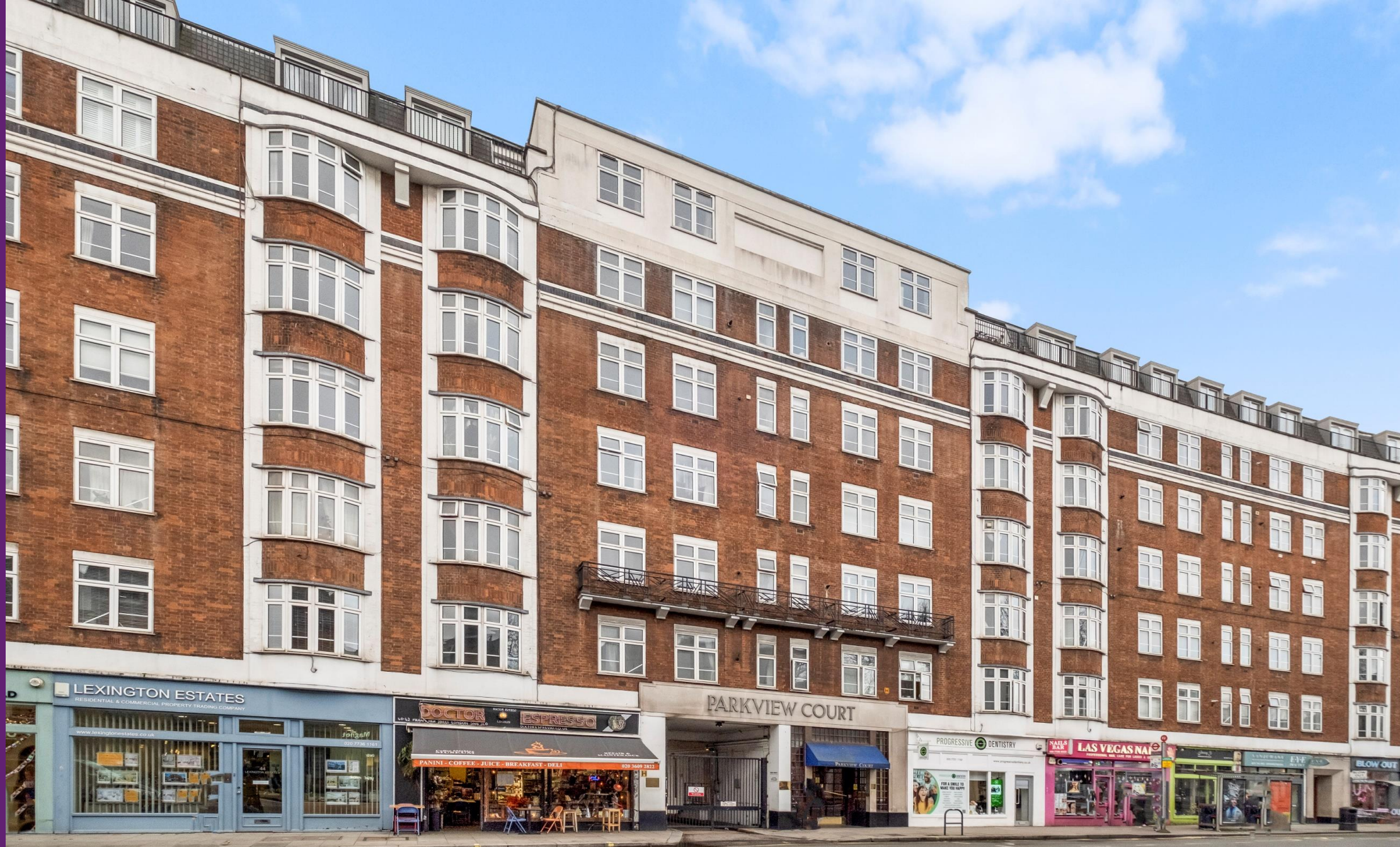
Parkview Court 38 Fulham High Street, SW6