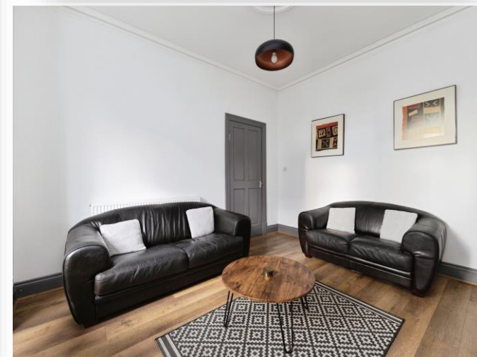
Beech Grove Road, Middlesbrough TS5 6RJ