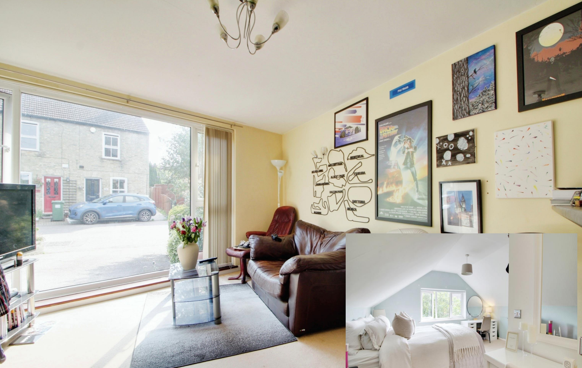
Annex providing Lounge/Kitchen/Shower Room and Bedroom