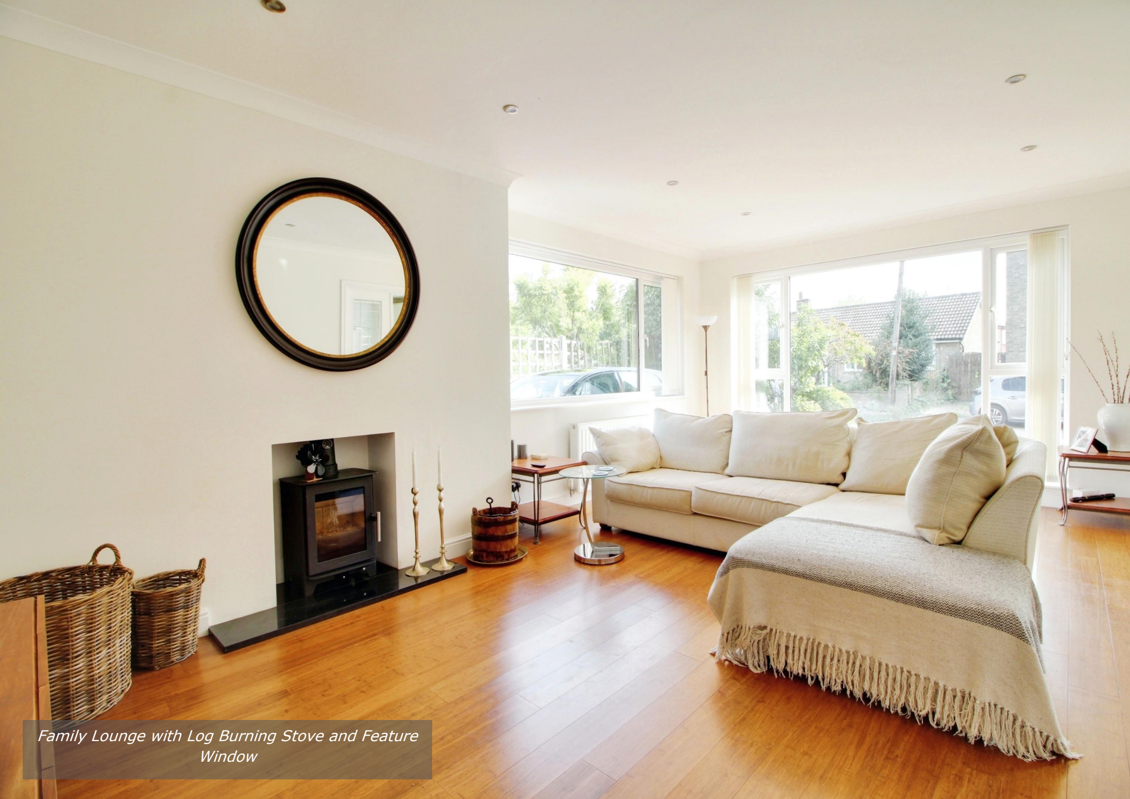
Family Lounge with Log Burning Stove and Feature Window