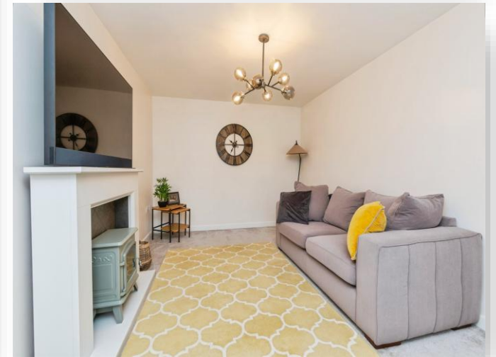
Aspen Gardens, HARTLEPOOL TS27 3DD