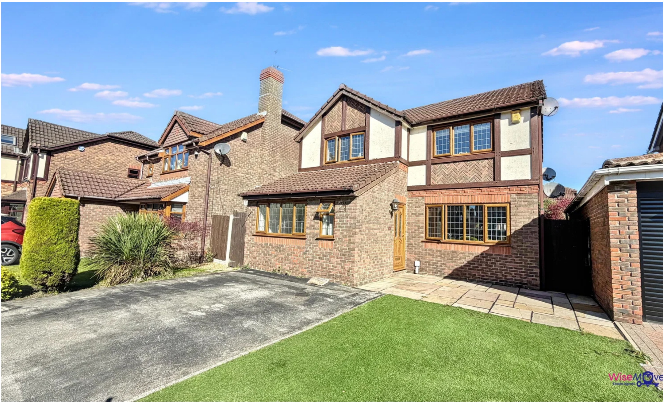
Upton Grange Widnes