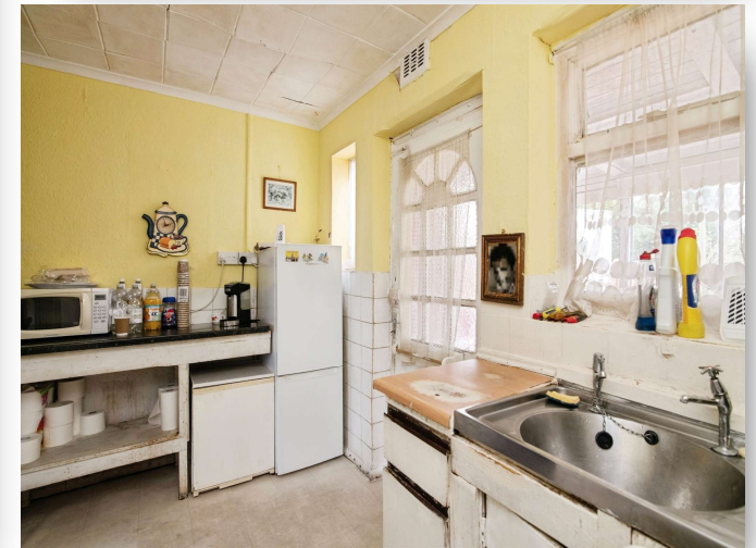
Kingsland Road, Birmingham B44 9QA