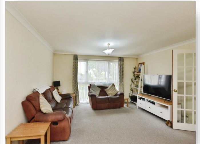
Welland Drive, Newport Pagnell, MK16 9DX