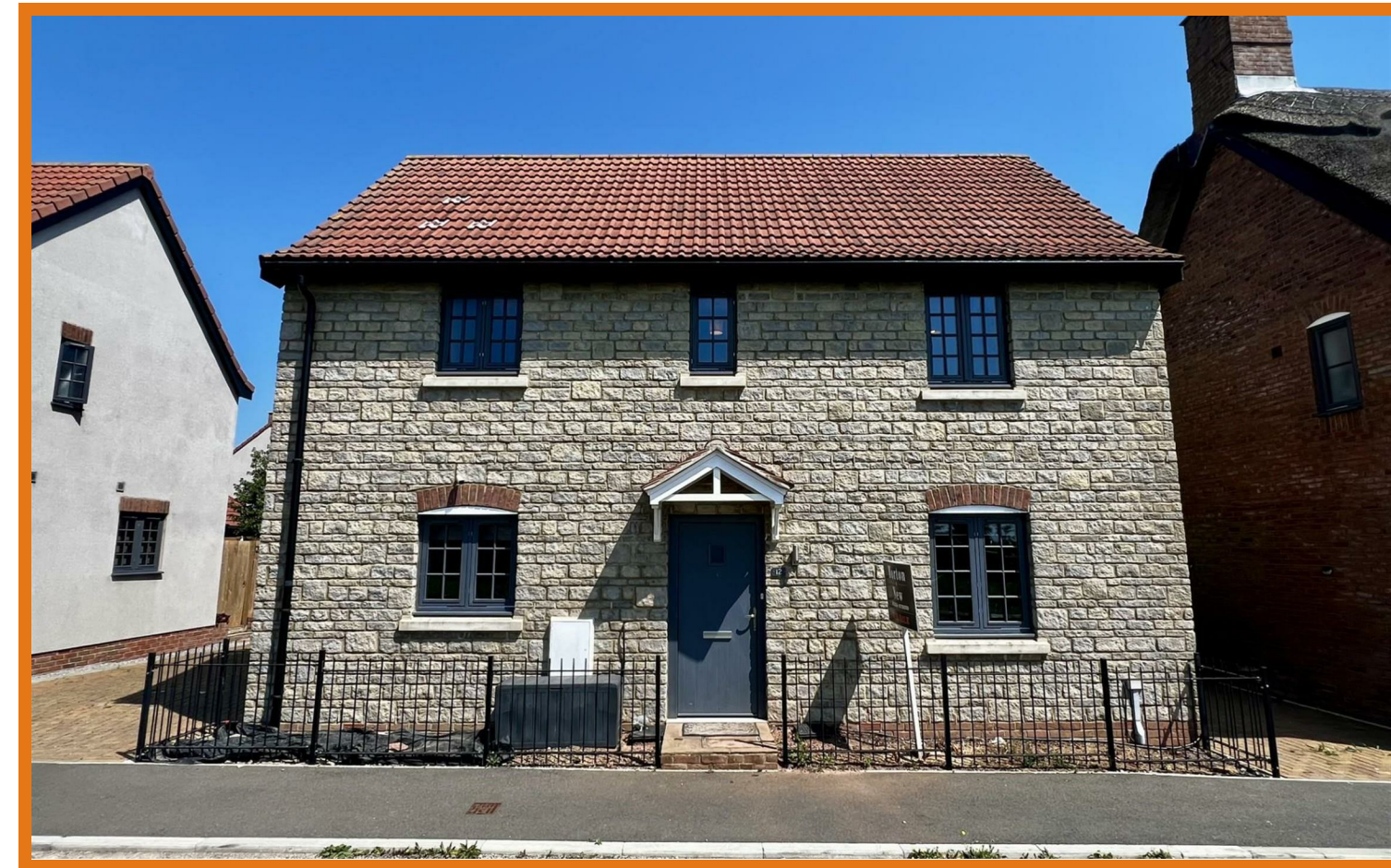
Manor Court Bishops Caundle