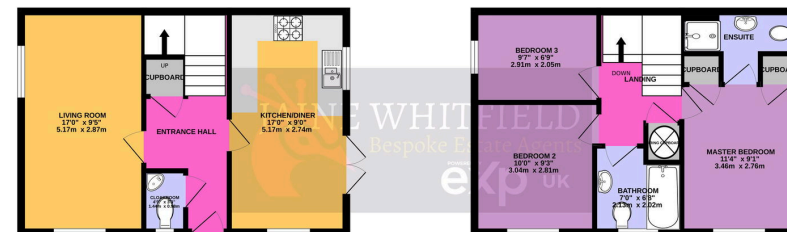
1ST FLOOR 422 sq.ft. (39.2 sq.m.) approx.

TOTAL FLOOR AREA : 846 sq.ft. (78.6 sq.m.) approx. While every attempt has been made to ensure the accuracy of the floorplan contained here, measurements of doors, windows, rooms and any other items are approximate and no responsibility is taken for any error, omission or misstatement. This plan is for illustrative purposes only and should be used as such by any prospective purchaser. The services, systems and appliances shown have not been tested and no guarantee as to their operability or efficiency can be given. Made with Metrepro ©2025