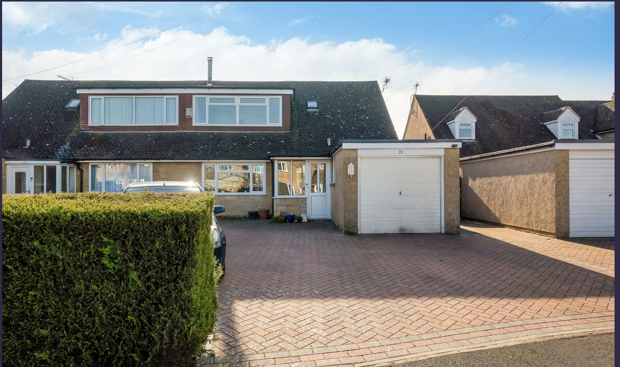
20 Meon Road, Mickleton, Gloucestershire, GL55 6TD