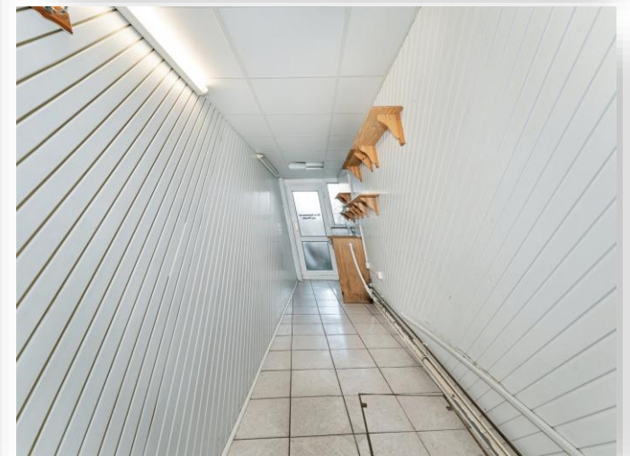
Nene Parade, March PE15 8TD