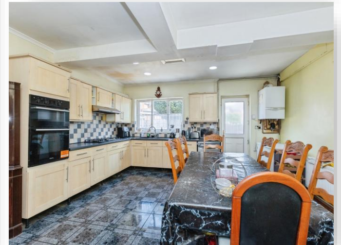
Trueway Road, Leicester LE5 5UG