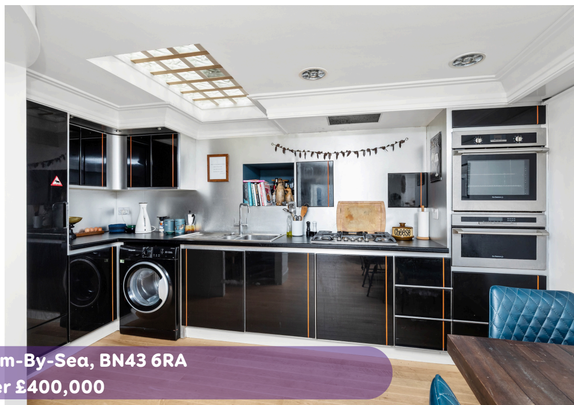
New Road, Shoreham-By-Sea, BN43 6RA Offers Over £400,000