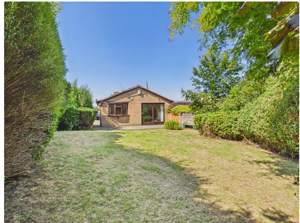
Vicarage View, Castleton OL11 2UA