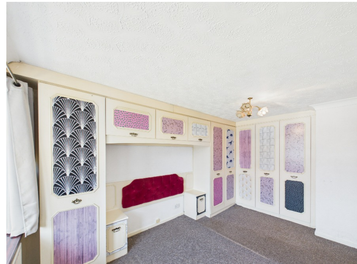
Vicarage View, Castleton OL11 2UA