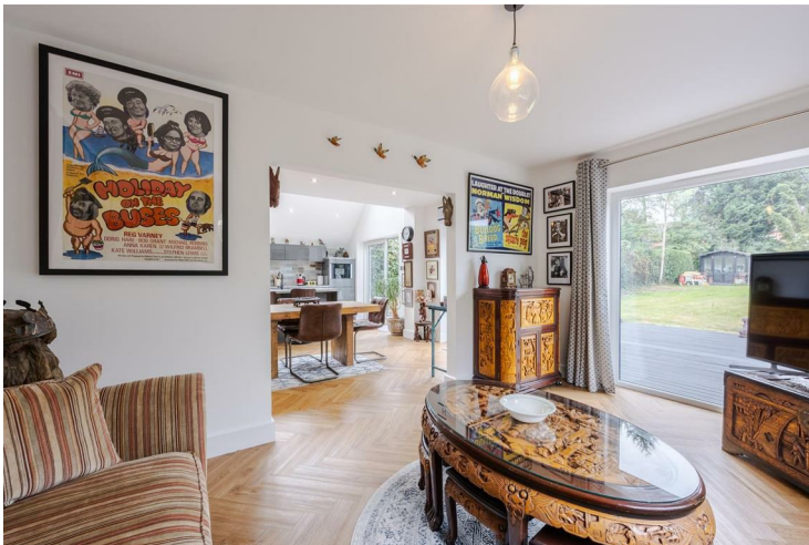
Sitting room 14'7" x 9'8" (4.45 x 2.95)