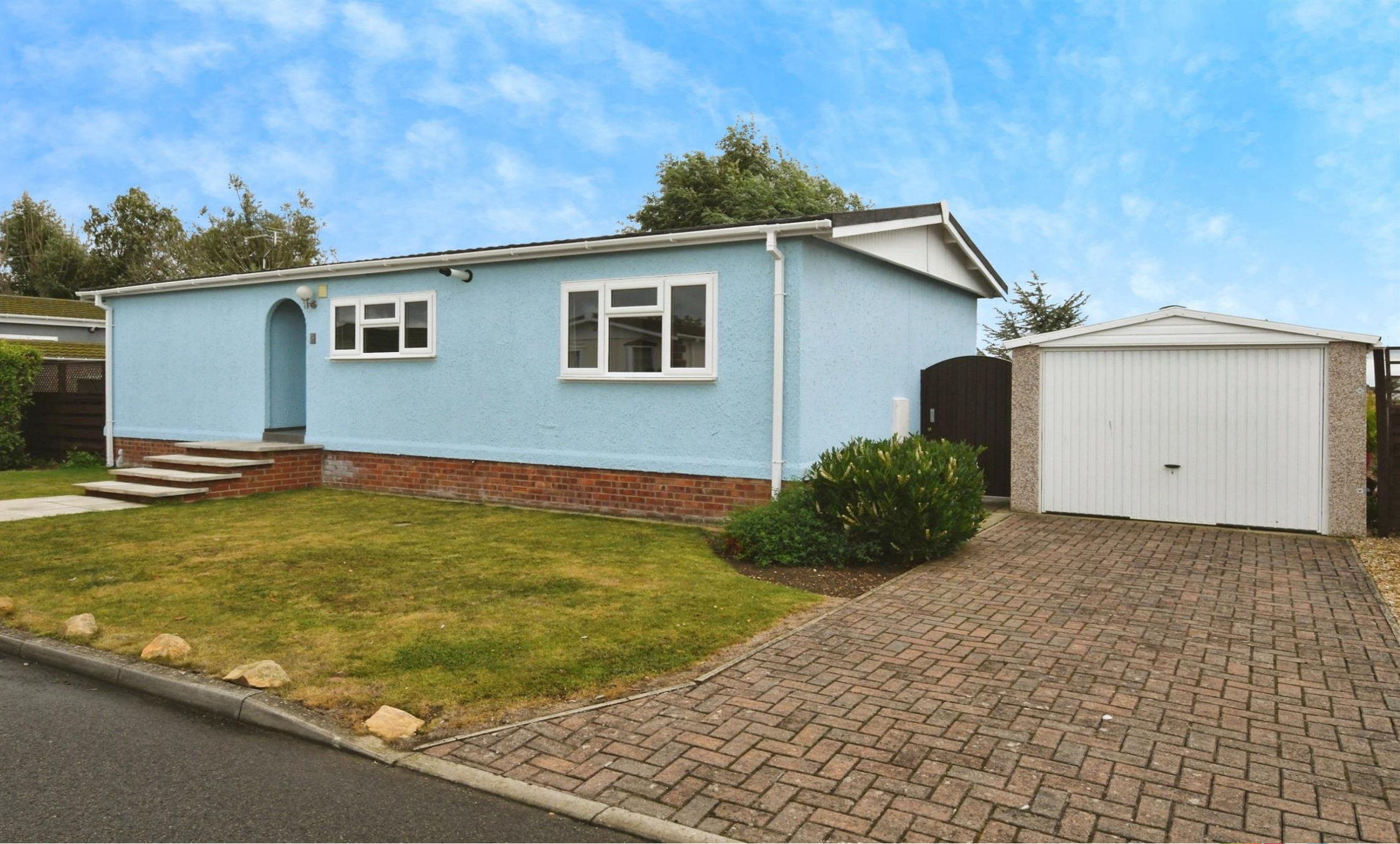
Marina View, Dogdyke Lincoln LN4 4UT