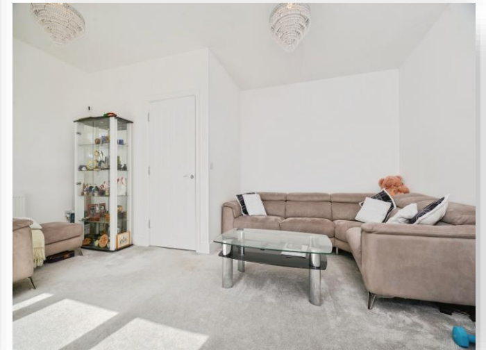
Infinity View, Stockton-On-Tees TS18 2FN