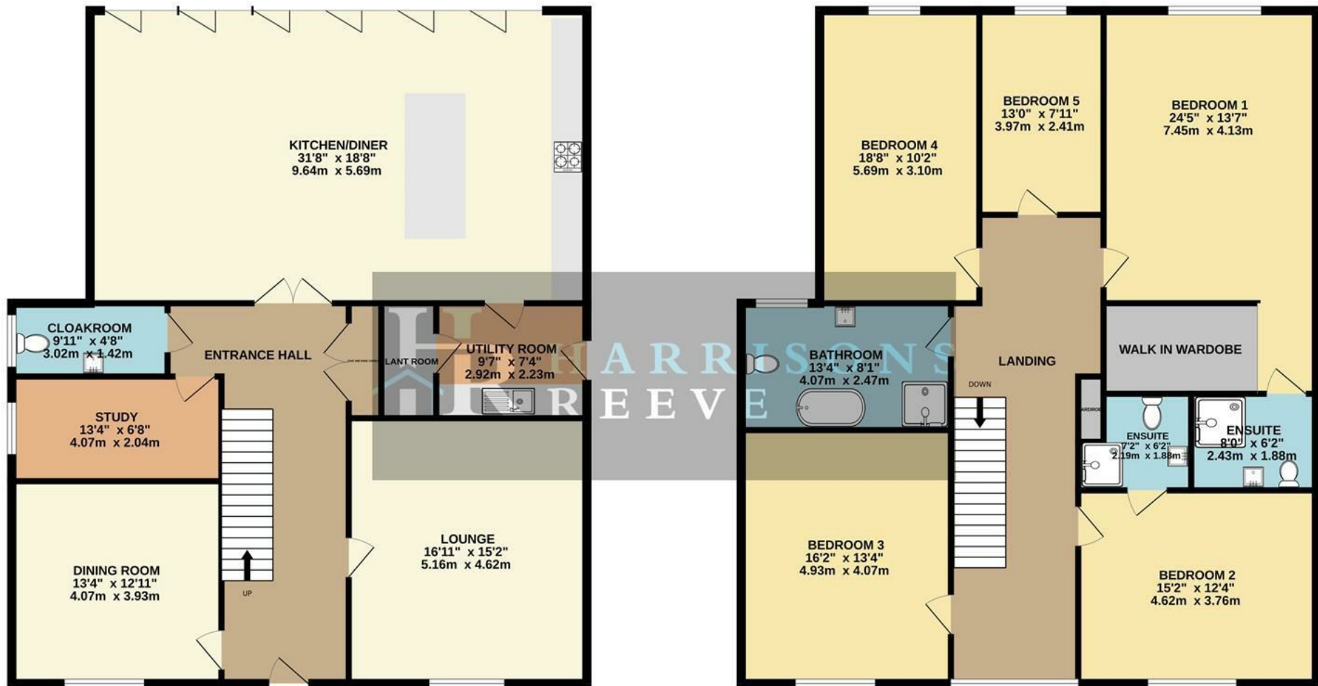
1ST FLOOR 1479 sq.ft. (137.4 sq.m.) approx.

TOTAL FLOOR AREA : 2959 sq.ft. (274.9 sq.m.) approx.