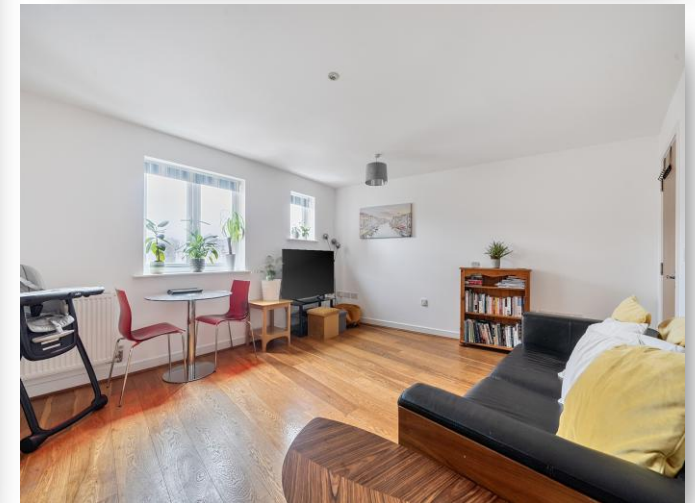
36 Blenheim Court, Kingsquarter, Maidenhead SL6 1AQ