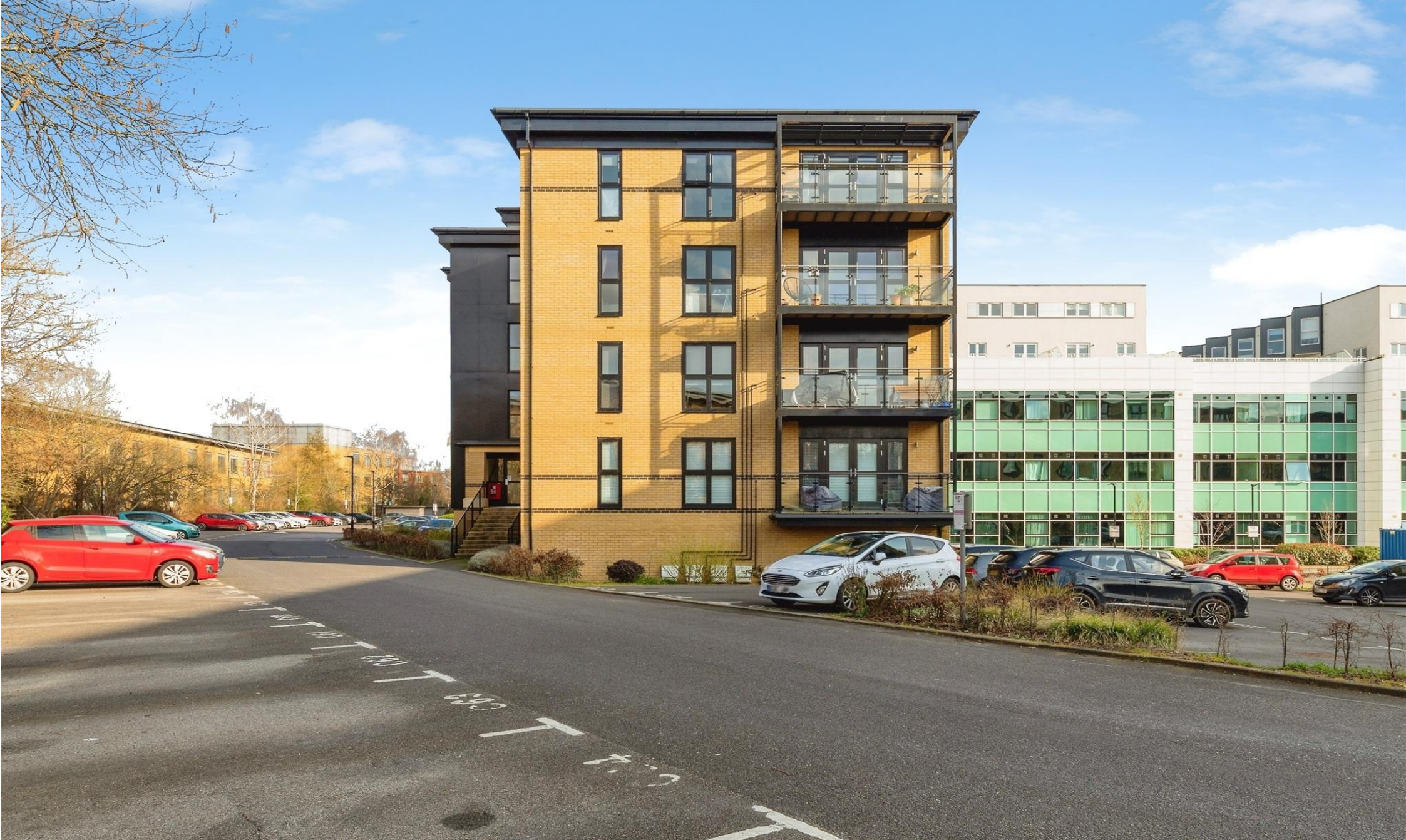
Brooklyn House Bessemer Road, Welwyn Garden City AL7 1WH