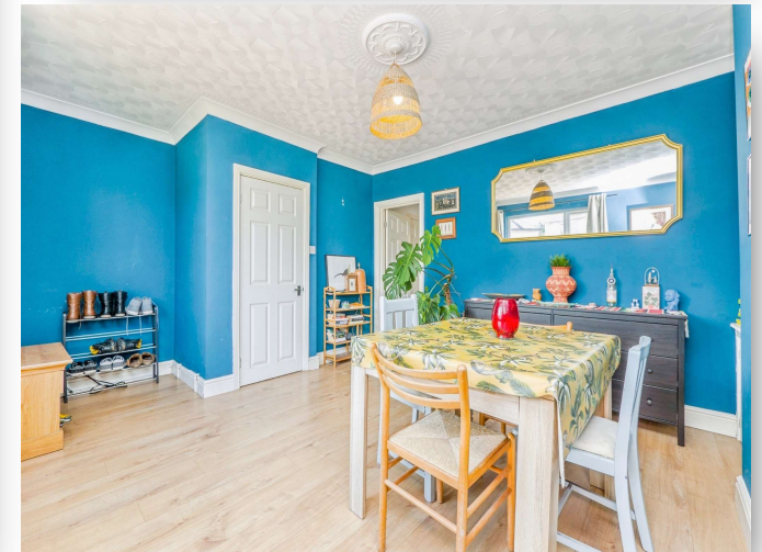
Madoc Road, Tremorfa Cardiff CF24 2SZ