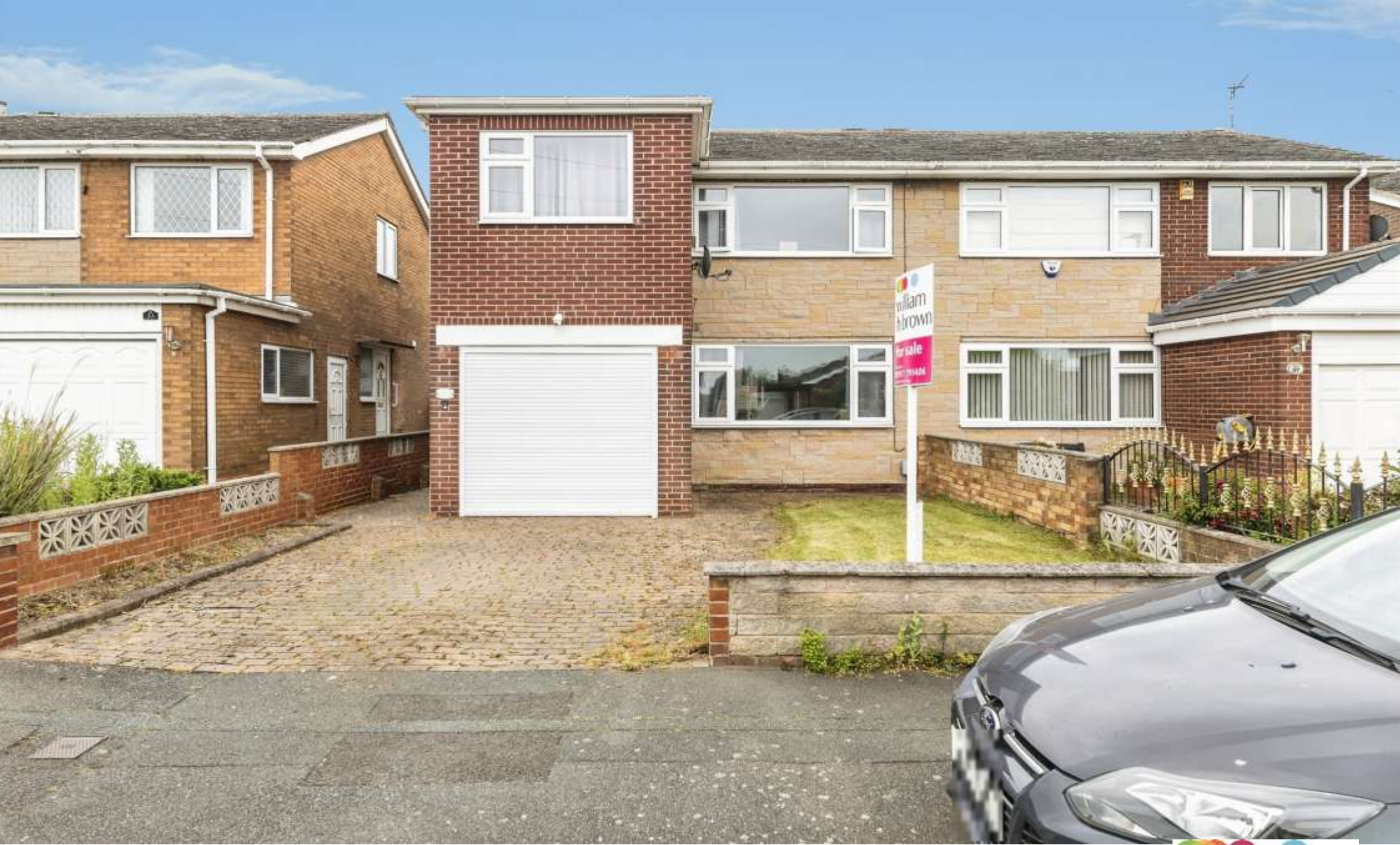
Castle Syke View, Pontefract WF8 4LX