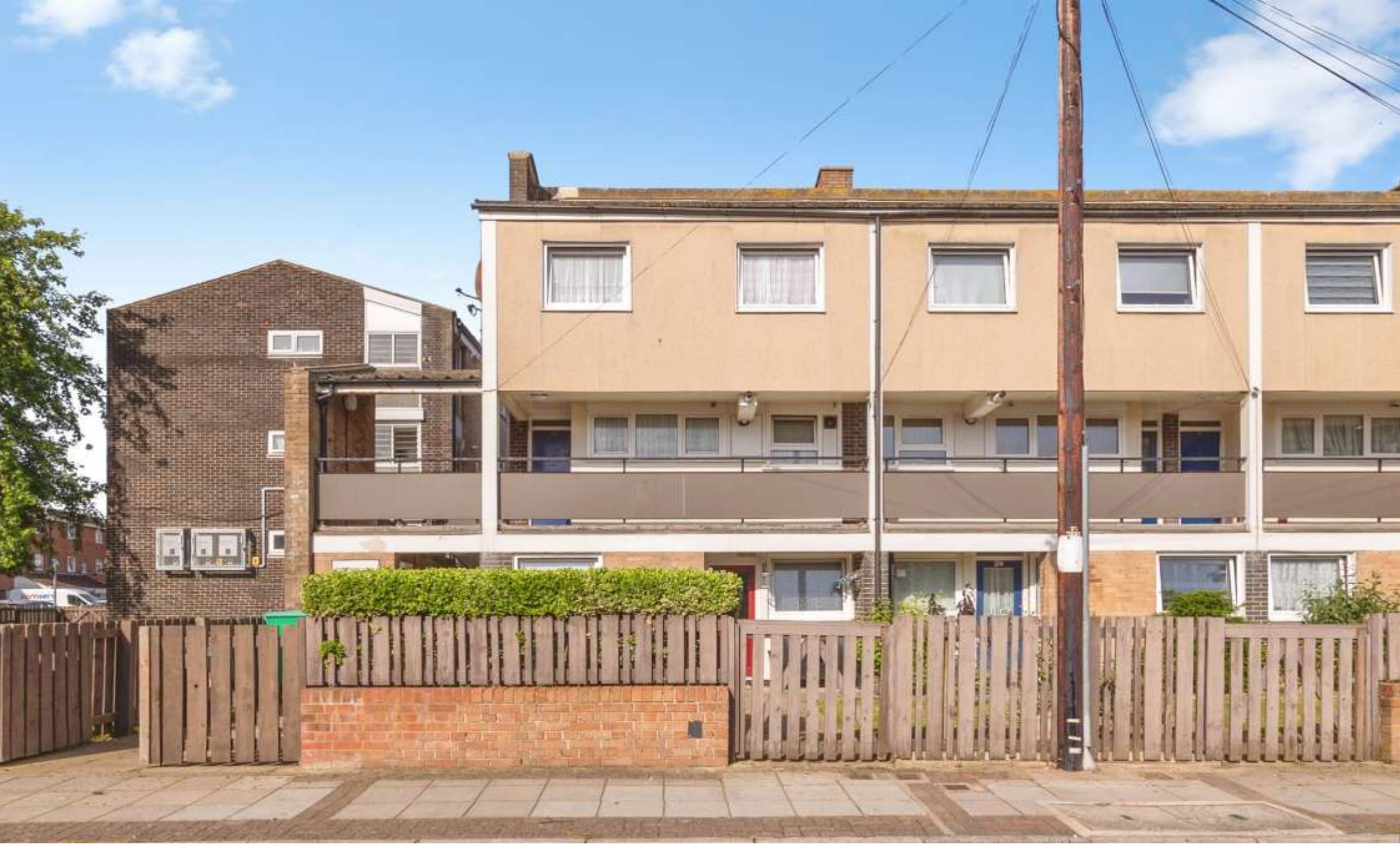
Cottage View, Portsmouth PO1 1LU