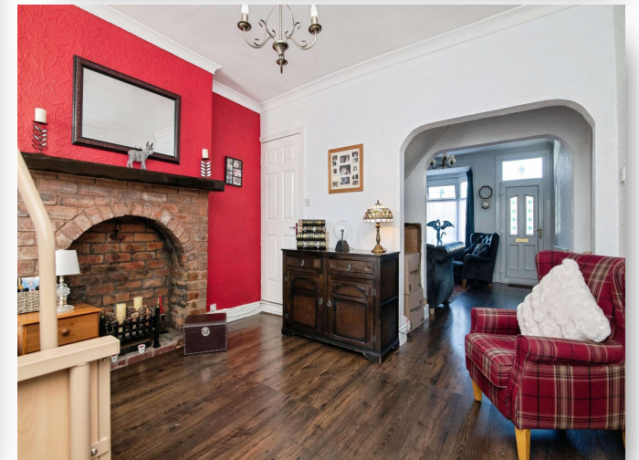
Brunswick Park Road, Wednesbury WS10 9QR