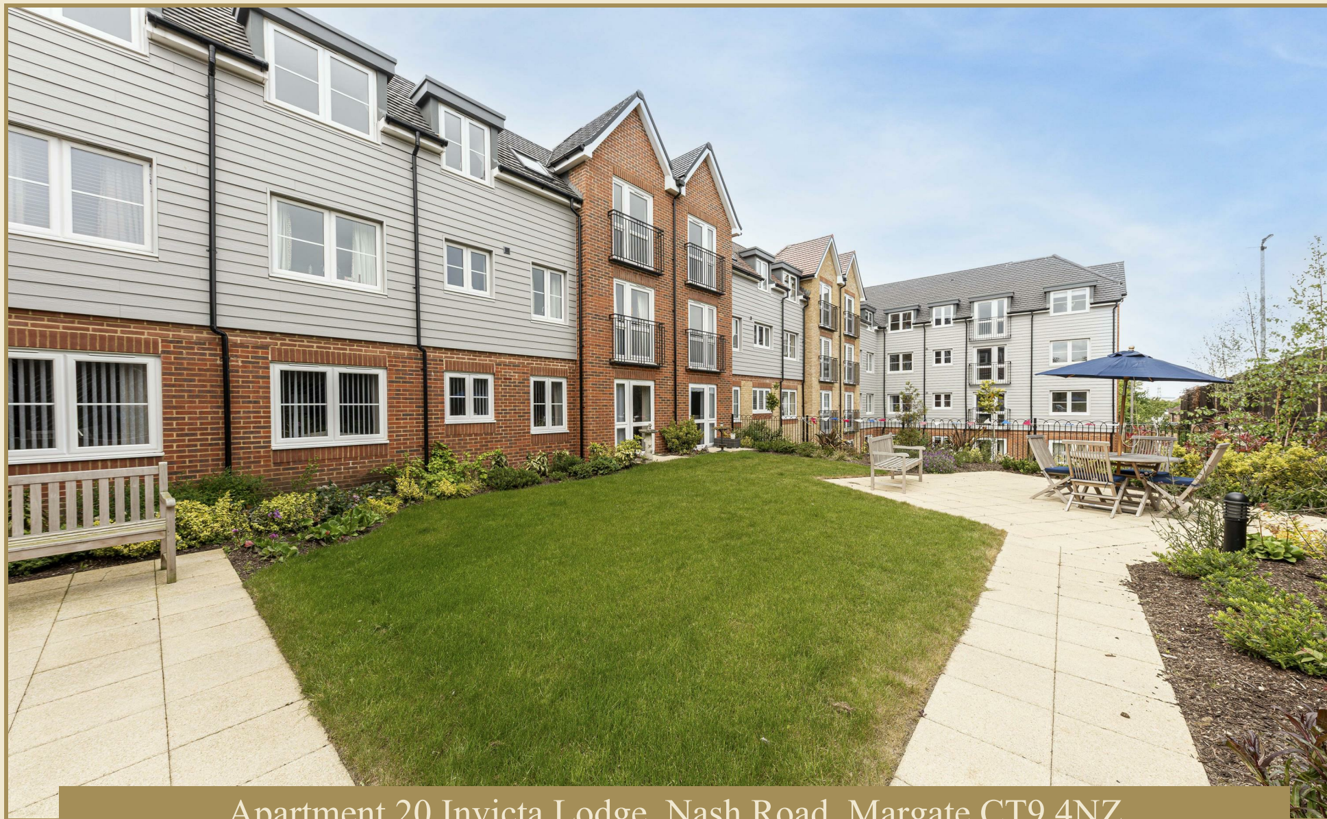
Apartment 20 Invicta Lodge, Nash Road, Margate CT9 4NZ