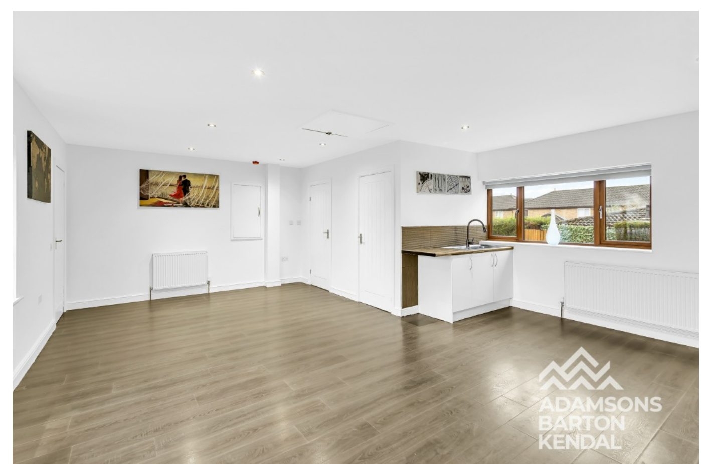
Hollowspell, Smallbridge, Rochdale OL12 9AW