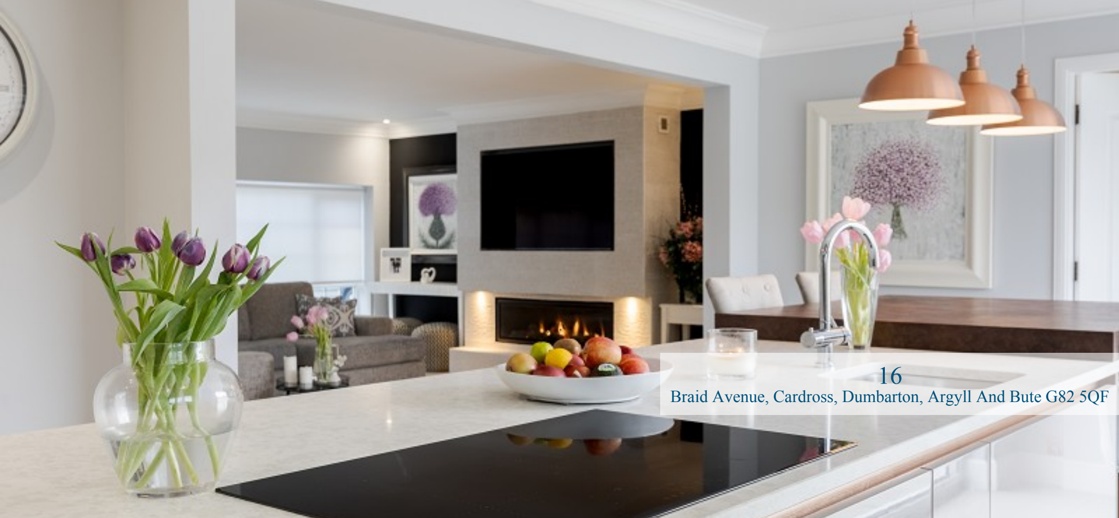
16 Braid Avenue, Cardross, Dumbarton, Argyll And Bute G82 5QF