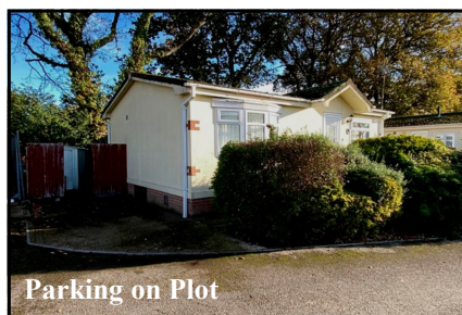
Parking on Plot