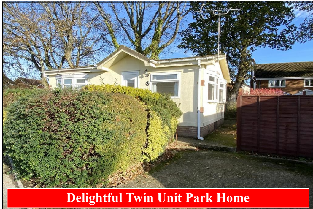
Delightful Twin Unit Park Home

65 Hillbury Park, Hillbury Road, Alderholt, Fordingbridge. SP6 3BW