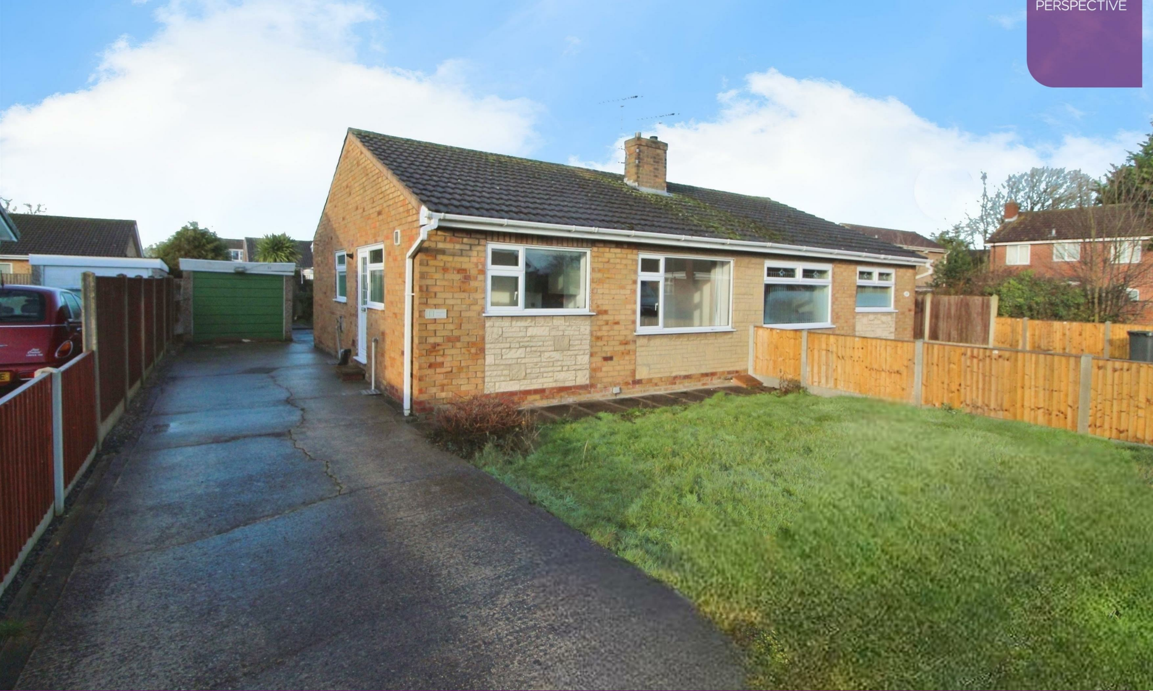
11 Springfield Close, Barlby, Selby, YO8 5JW £199,950