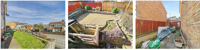
Stepped front garden. Paved side access to rear garden with lawn and raised beds.