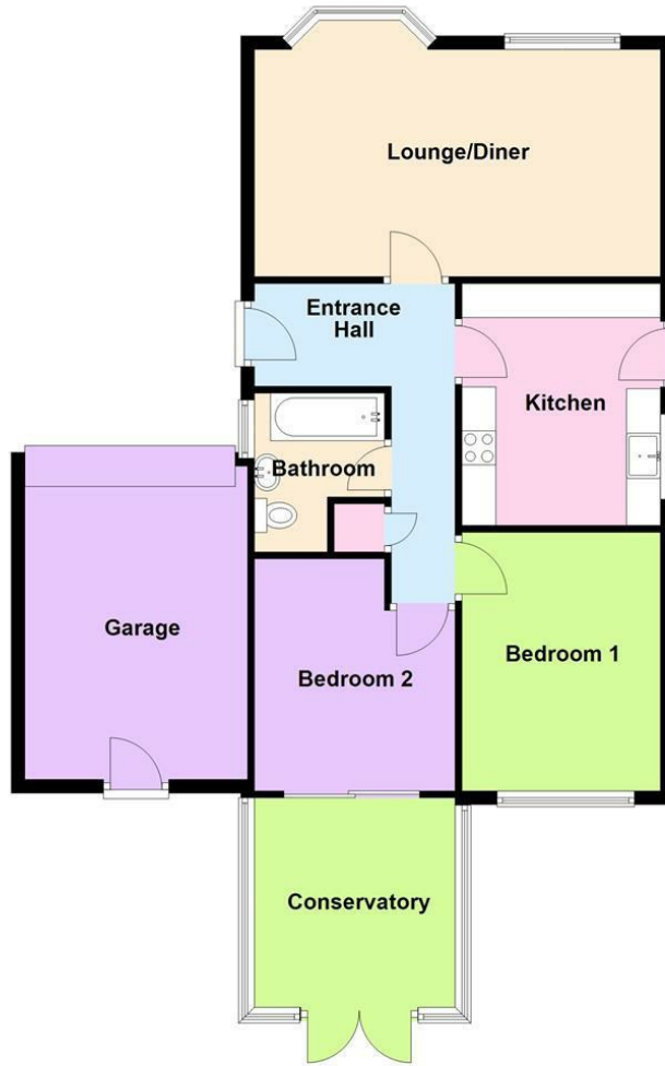
7 The Highfields, South Cave