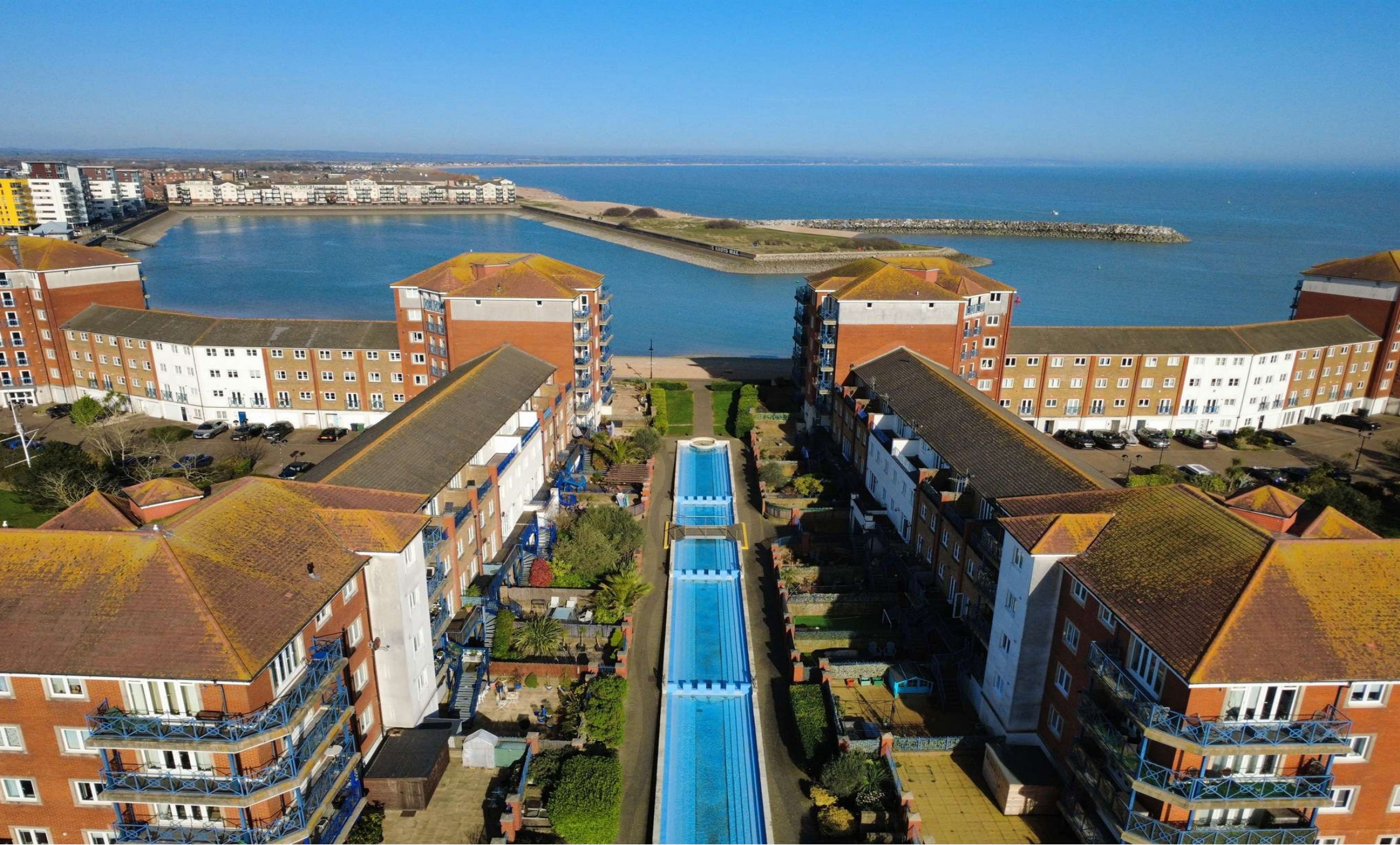
San Juan Court, Eastbourne BN23 5TP