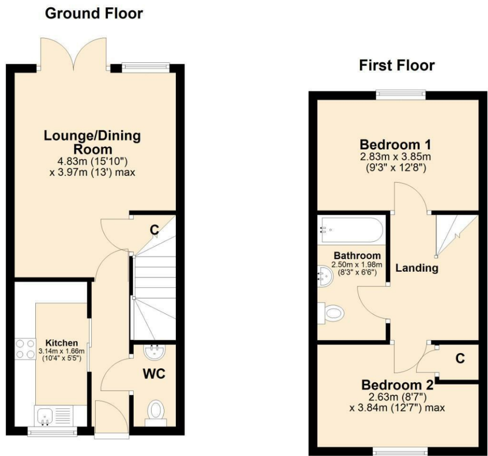
Harford Way, Landkey