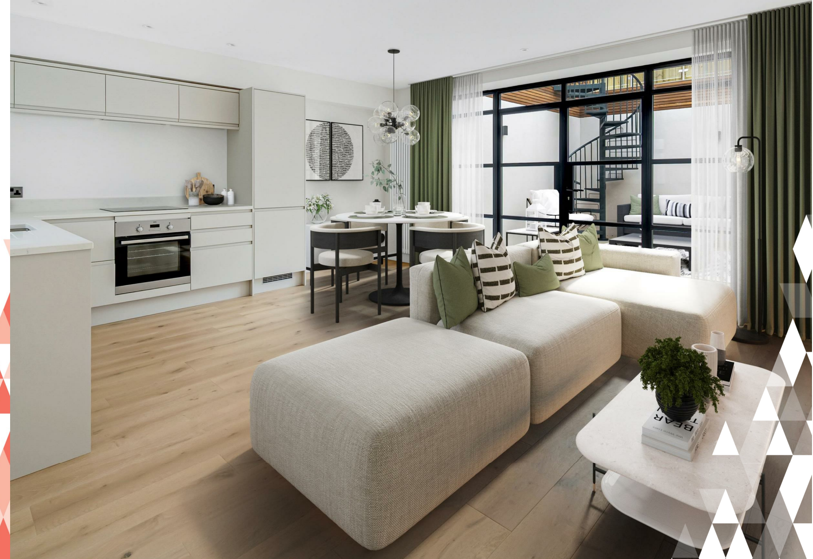
Mill Hill Road Approximate Gross Internal Area = 72.0 sq m / 775 sq ft