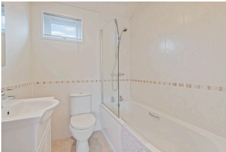
Granny Lodge, 11 Briar Hill, Newton Ferrers, Plymouth, Devon, PL8 1AR Approximate Gross Internal Floor Area = 71.8 sq m / 774 sq ft