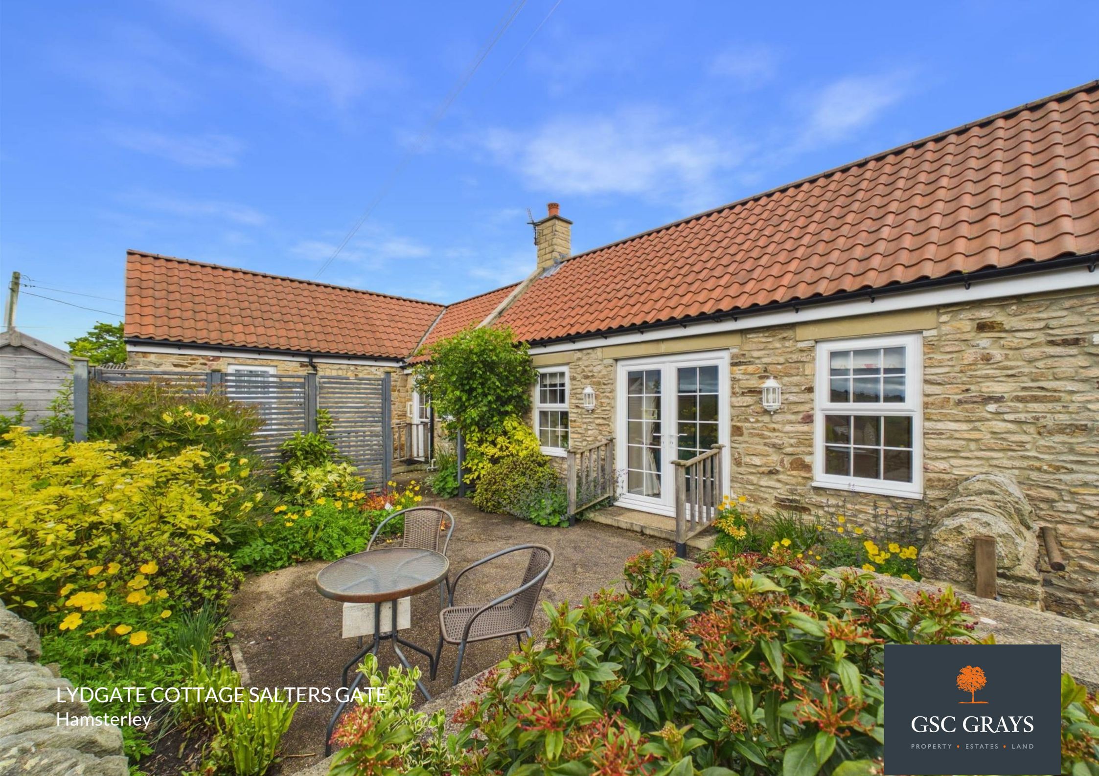
LYDGATE COTTAGE SALTERS GATE Hamsterley