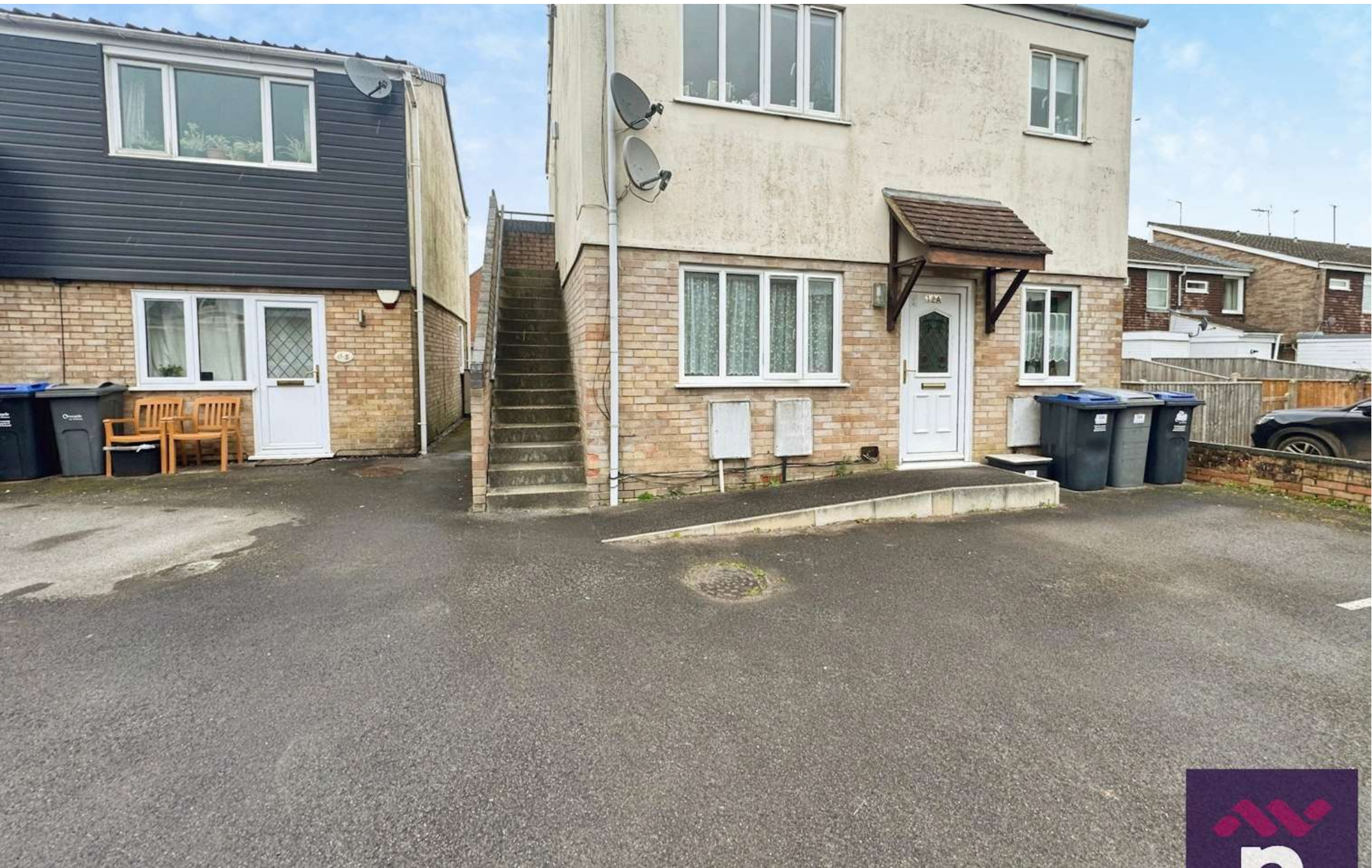
Foreminster Court, Warminster