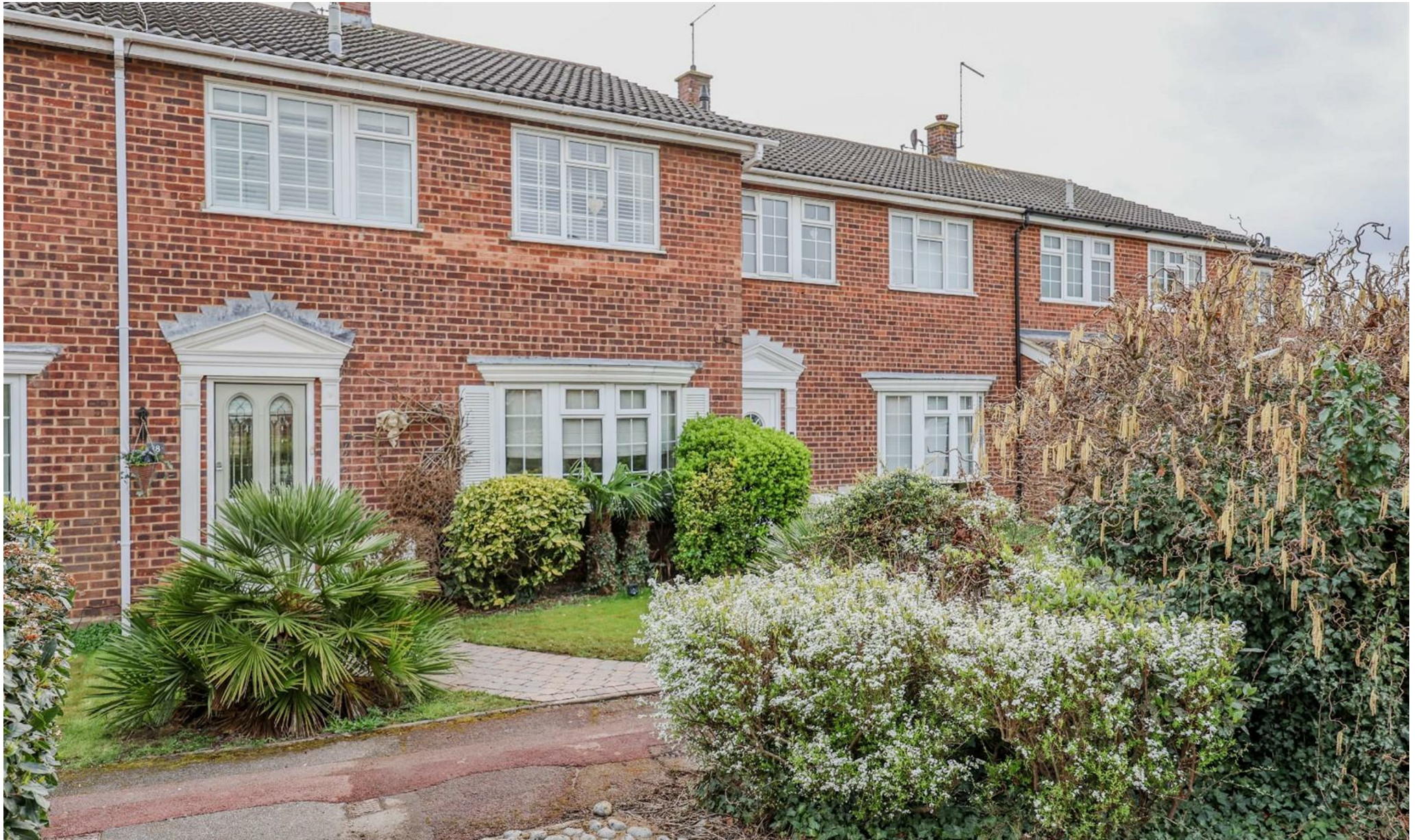
Collins Way, Leigh-on-Sea £395,000