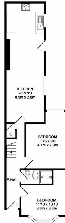
GROUND FLOOR APPROX. FLOOR AREA 573 SQ.FT. (53.3 SQ.M.)