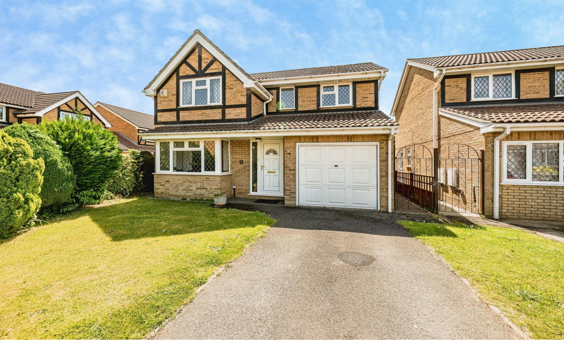
Portland Close, Slough SL2 2LT